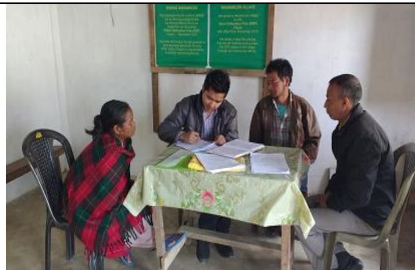
Baseline Survey under EKH IWMP-XI in East Khasi Hills District