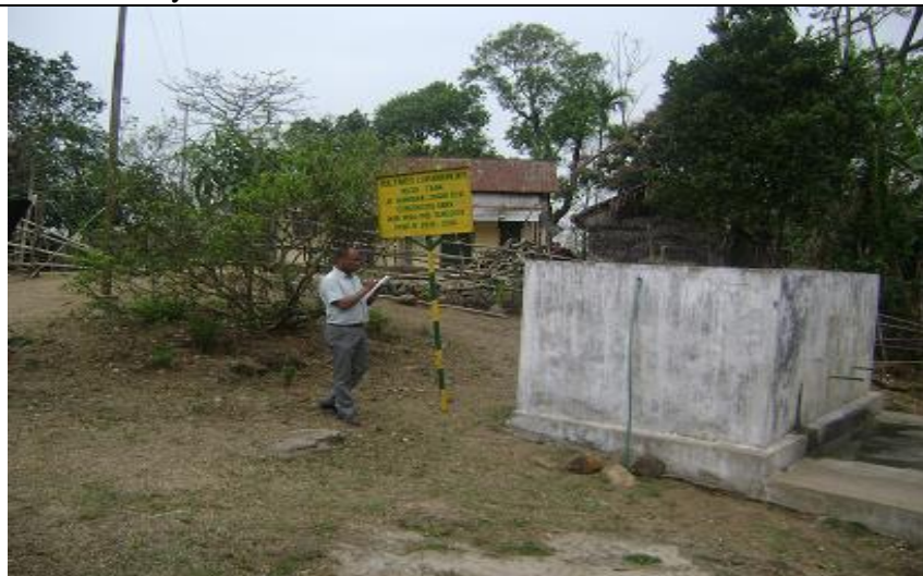
Evaluation Field Visit in South West Khasi Hills District