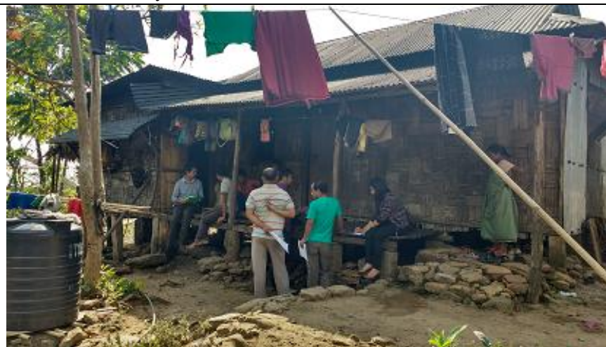
Baseline Survey under EKH IWMP-XIII in East Khasi Hills District