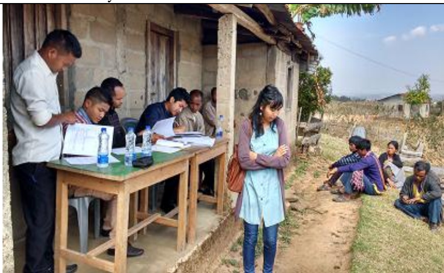
Baseline Survey under WKH IWMP-VIII in West Khasi Hills District