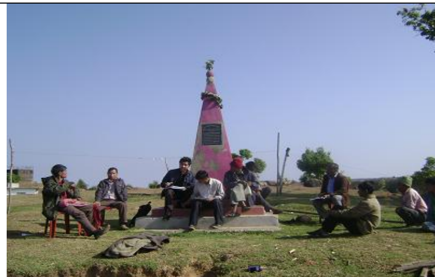
Baseline Survey under SWKH IWMP-IV in South West Khasi Hills District