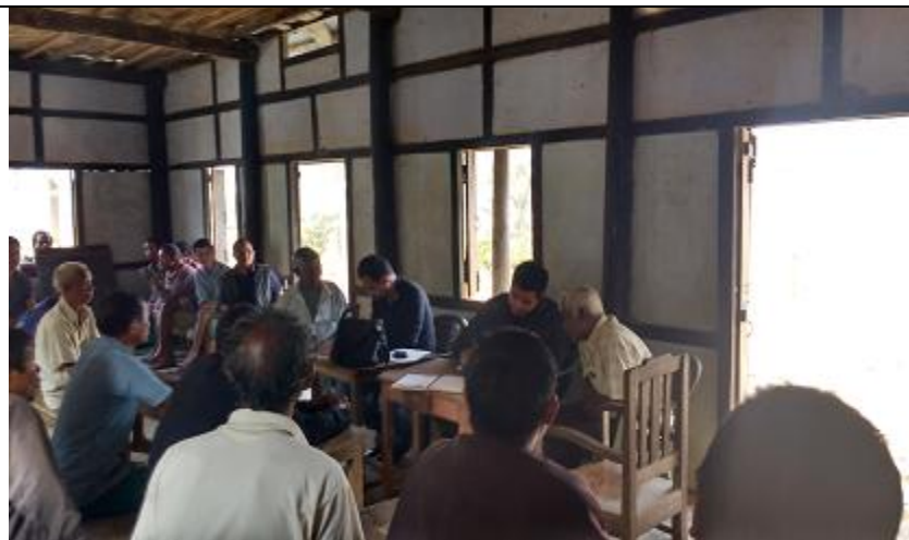
Baseline Survey under NGH IWMP-IV in North Garo Hills District