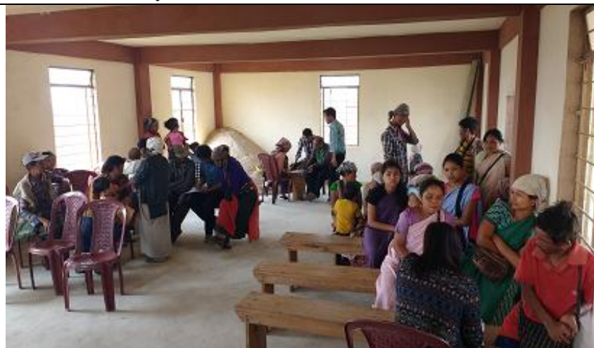
Baseline Survey under EKH IWMP-XIII in East Khasi Hills District