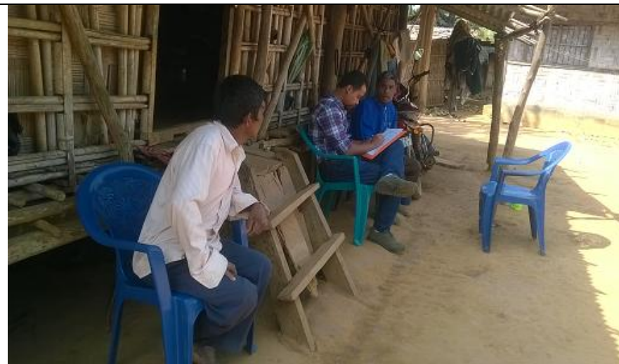
Baseline Survey under WGH IWMP-XIII in West Garo Hills District