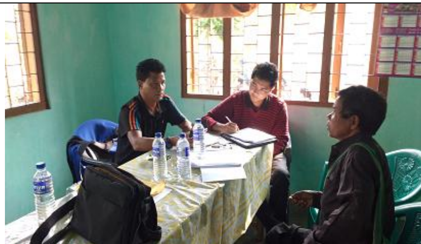
Baseline Survey under NGH IWMP-IV in North Garo Hills District