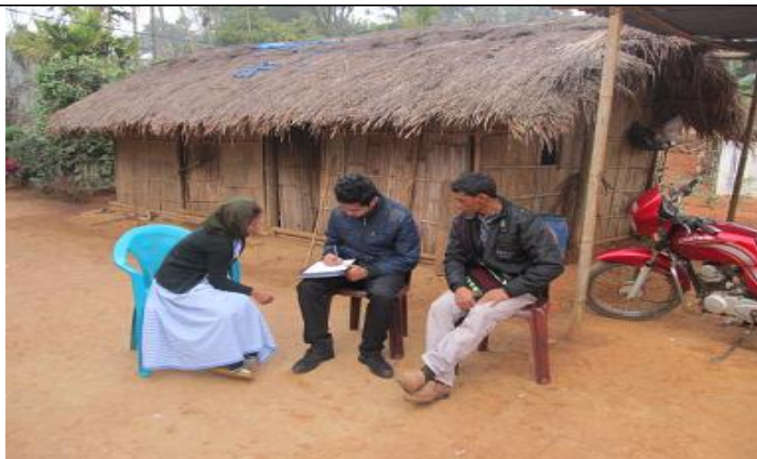
Baseline Survey under RB IWMP-VIII in Ribhoi District