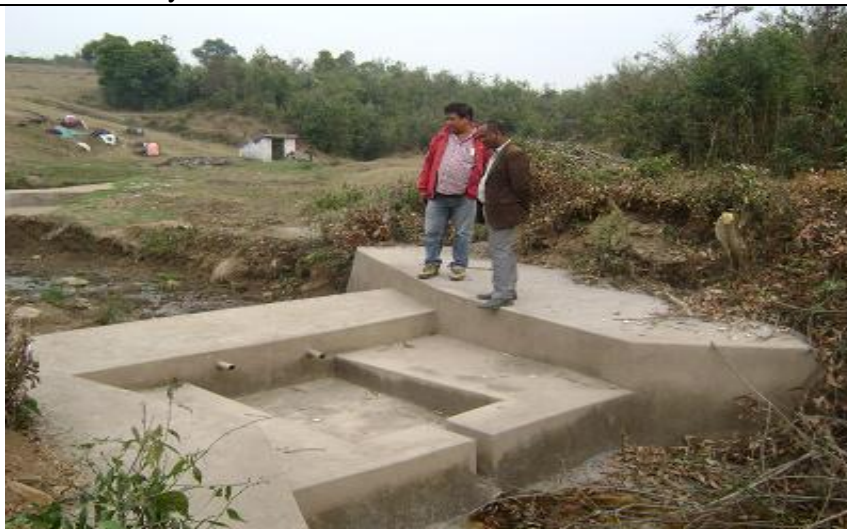
Evaluation Field Visit in South West Khasi Hills District