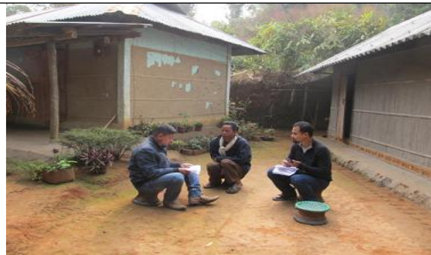
Baseline Survey under RB IWMP-VIII in Ribhoi District