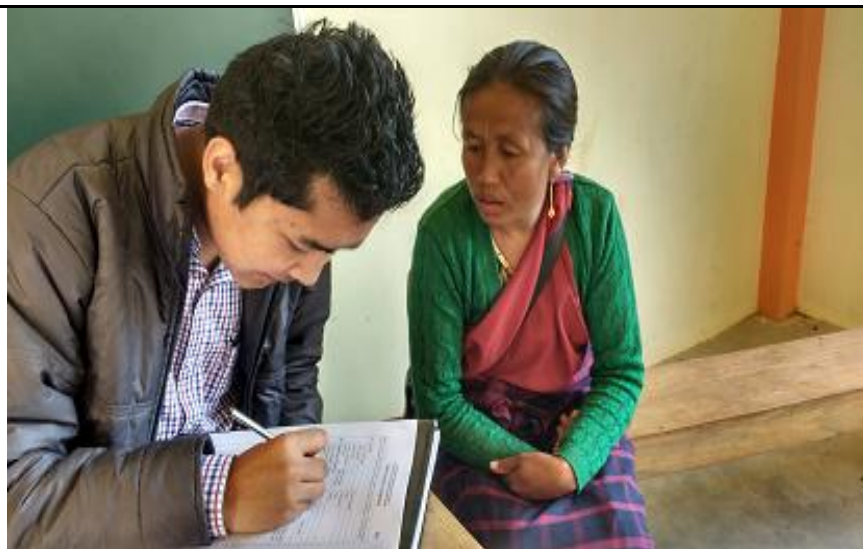
Baseline Survey under EKH IWMP-XI in East Khasi Hills District