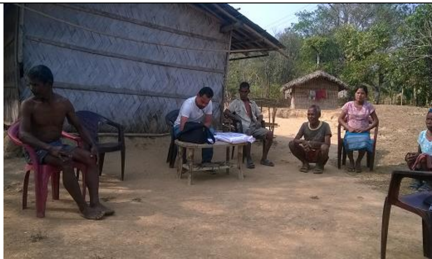
Baseline Survey under WGH IWMP-XIII in West Garo Hills District