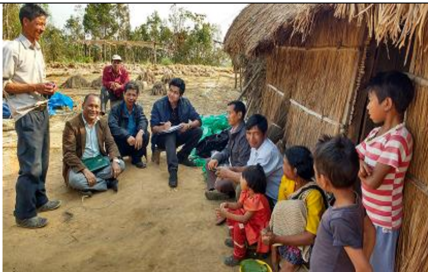
Baseline Survey under SWKH IWMP-IV in South West Khasi Hills District