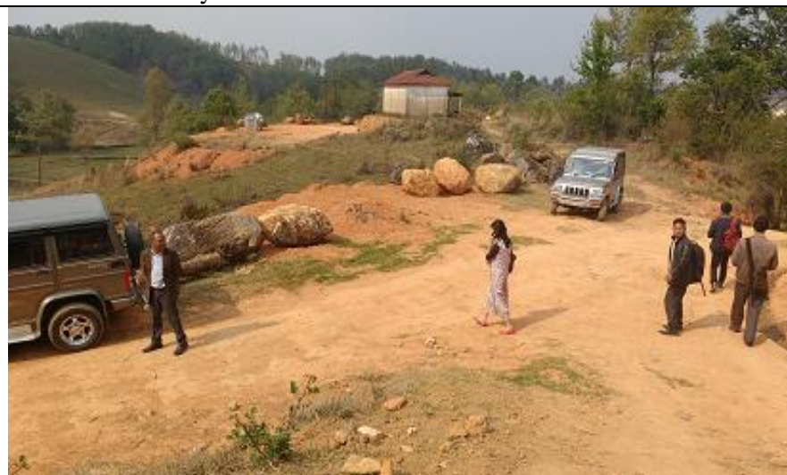
Visit to Remote Areas for Baseline Survey in West Khasi Hills District